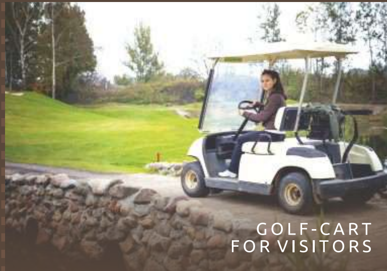
GOLF-CART FOR VISITORS