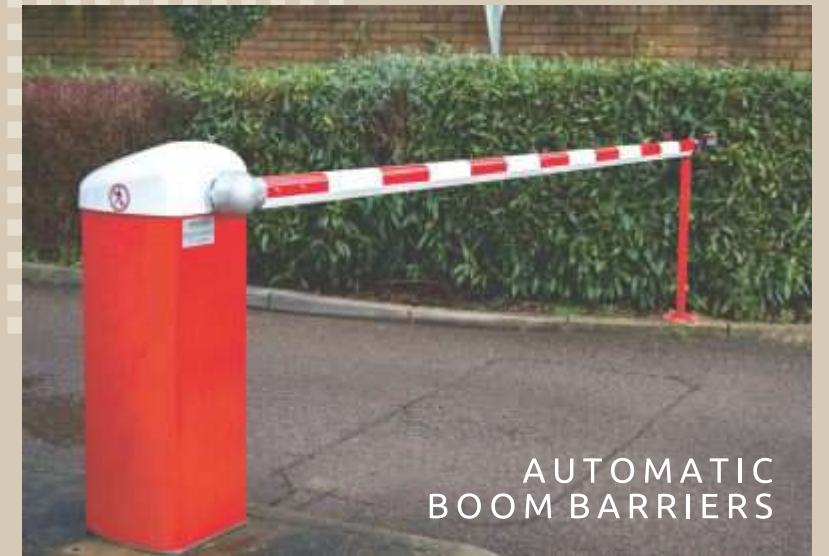
AUTOMATIC BOOM BARRIERS